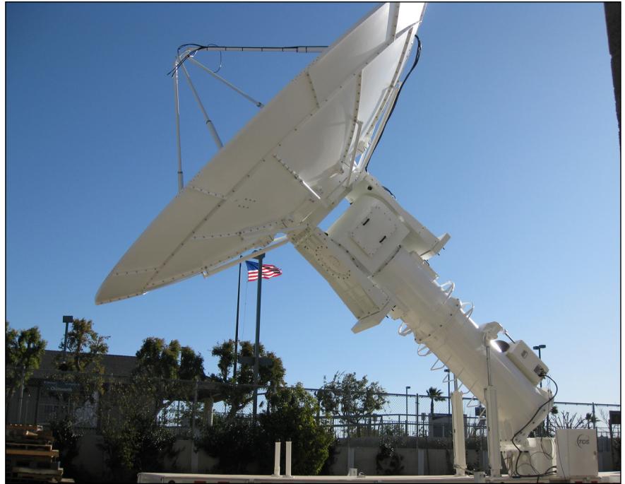
TCS Model 6000-7.3 on Trailer Reclining During Installation