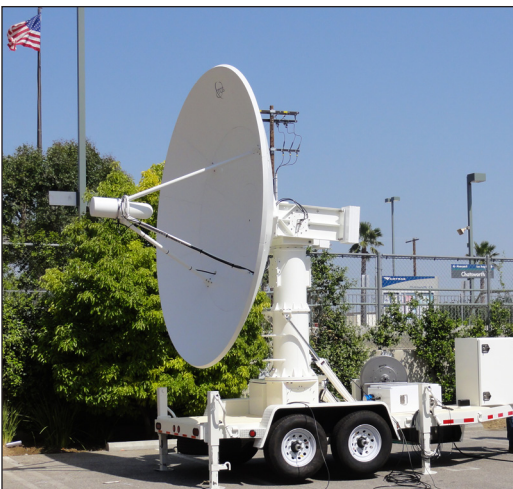
TCS Model 3000-12 on Trailer

No matter how you look at it, mobile telemetry systems give greater flexibility in the areas of mission location and mission availability. This results in more testing, more data, and more return on your telemetry investment.