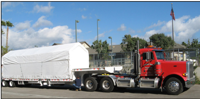
TCS Model 6000-7.3 Packed for Travel