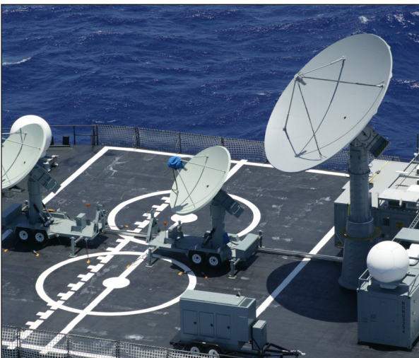
Here is a ship-stabilized, 7.3 meter Model 6000 System.

With larger systems, we can provide more exotic feed configurations. The system above autotracks in L- and S-Band, but receives signals in UHF, VHF, L-Band, S-Band, and C-Band. This system also has up-link capability.